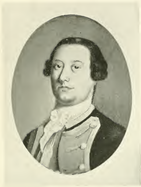
GENERAL JOSHUA WINSLOW